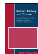
Russian History and Culture