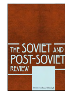
The Soviet and Post-Soviet Review