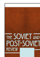
The Soviet and Post-Soviet Review