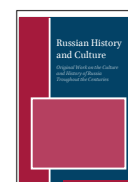
Russian History and Culture

Journals and older book titles are distributed via Brill N.V. If you want to place an order, please contact Turpin : brill@turpin-distribution.com